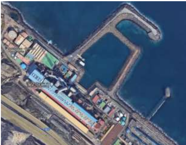
Fig. 1. Location Las Palmas III desalination plant.

The high-pressure booster pumps that drive these racks are characterised for being the equipment with the highest energy consumption, as they need to reach 50-60 bar pressure in order to obtain product water with suitable quality for human consumption.