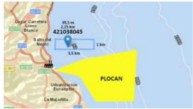
Fig. 5. Identification of the area intended for the deployment of the wave farm

Of the points identified in Figure 4, it should be noted that wave converter operating range is between bathymetries of 20-100 metres. In addition, it is important to note that the length of the mooring cable used to anchor the device varies depending on the size of the pilot area, ranging from 100 metres to 200 metres [9]. In this sense, SIMARs 4038009, 4038010, 101901 and 4040010 exceed 100 metres depth. Consequently, the SIMAR point 421038045 is the proposed location to install the Wavepiston wave converter. Once SIMAR has been selected, the farm configuration is delimited by the proximity to the coast and the PLOCAN research area. Maintaining a distance of 500 m from both constraints results in a potential area of 1 km long and 3.5 km wide (see Figure 5). In compliance with the interWEC distance, 50 wave converters can be installed in the selected area.