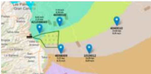
Fig. 4. SIMAR points characterisation

Figure 4 shows the bathymetry, distance to the coast and average wind speed for each SIMAR point.